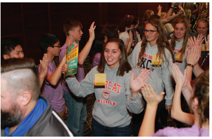
The Iowa Student Leadership Conference brings together over 1,500 students leaders and advisers annually at the Iowa Events Center.

address the critical need to develop today's leaders with the proficiency to make the most of their time and contemplate potential impact.